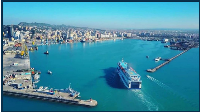
Durrës Port 32 km