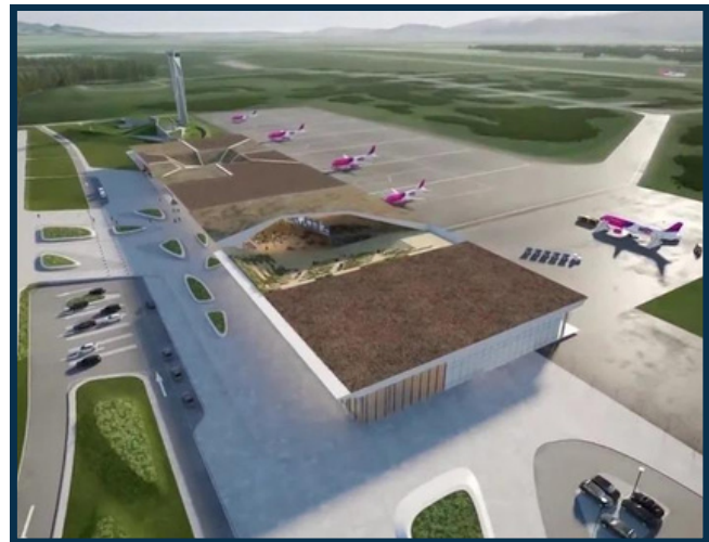
Kukës International Airport 153 Km