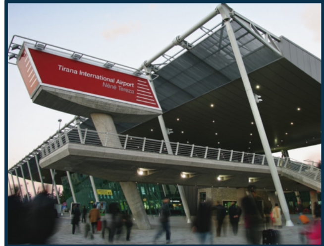
Tirana International "Mother Tereza" Airport 17 Km