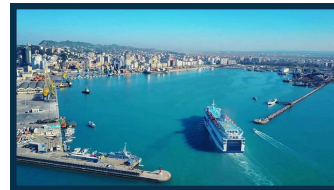
Durrës Port 32 km