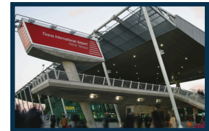
Tirana International "Mother Tereza" Airport 17 Km