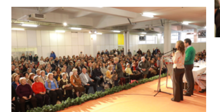
VISITORS 2024 – 16,528 visitors, without professionals and trade visitors